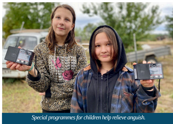
Special programmes for children help relieve anguish.