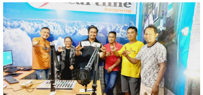
Lampung Indonesia studio also upgraded with NZ funds.

Please pray for our teams, broadcasts, and audiences in Indonesia: for clear signals and faithful listening. To support this work, donate to 'Indonesia,' 'First Response,' or 'Where Most Needed.' Thank you.