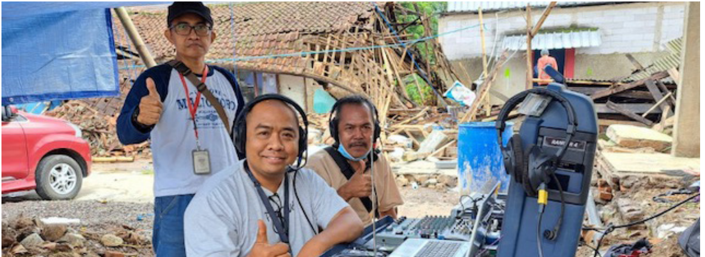
Broadcasting from a 'suitcase studio' in Cianjur, Indonesia.

When disaster happens, sound quality is key.